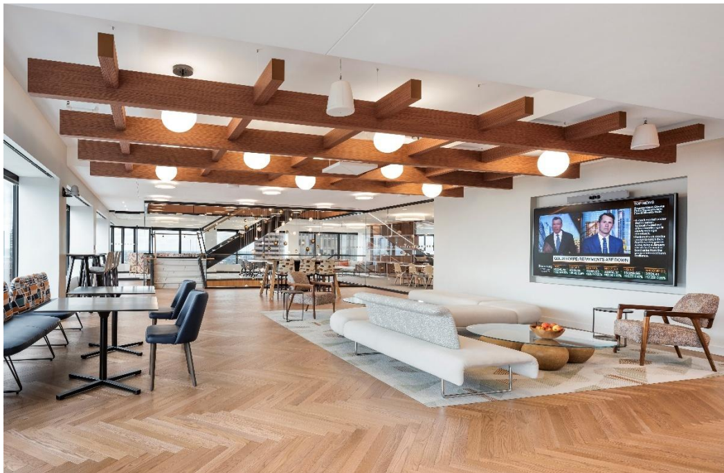
Open area the customer's Boston Headquarters