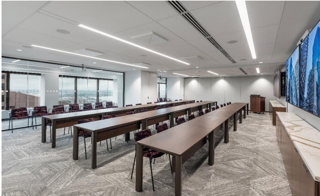
Training Room in a Room Ready Customer Headquarters Installation in Boston

As an additional proof point of RoomReady's confidence in the TCC 2, the company recently installed the ceiling microphone in its new headquarters in Bloomington, Illinois. When it came time to design the meeting rooms within RoomReady's new headquarters, the company wanted to showcase their streamlined approach to AV integration using TCC 2. These rooms embody RoomReady's core values of simplicity, speed, and flexibility, while providing consistent, high-quality audio and a user-friendly experience.