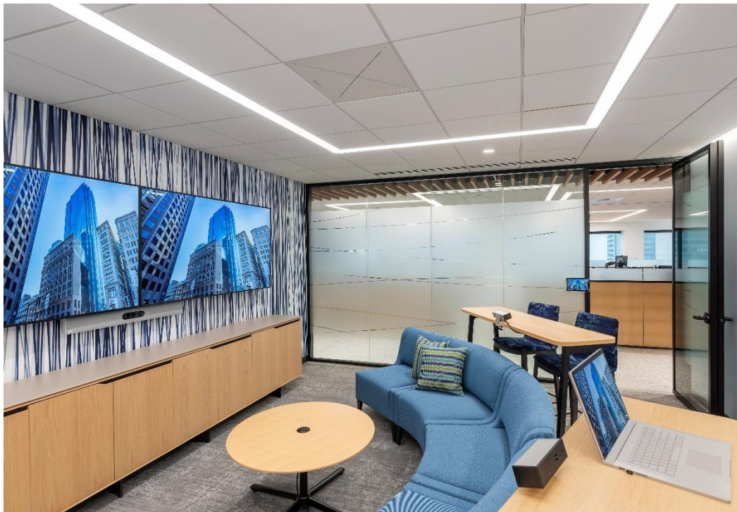
Conference Room B the customer's Boston Headquarters

Part of Sennheiser’s TeamConnect (TC) family, the TCC 2 stands out in this lineup, delivering trusted Sennheiser audio quality by using patented Dynamic Beamforming technology to capture perfect speech intelligibility from every corner of the room with exceptional clarity. This technology automatically tracks the position of speakers in the room and switches between speakers in real time, ensuring that their voices are clearly captured. This makes it an ideal choice for large sized meeting rooms, ensuring that no participant's voice goes unheard. From large meeting rooms to divisible training rooms, RoomReady is able to create a simple, high-quality meeting room environment with the TCC 2. The microphone's built-in 28 broadcast-quality microphone heads make the sound clear and natural, supporting both software-based video platforms and VoIP systems, thanks to its Dante and analog ports.